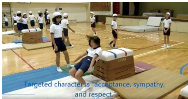
A video clip of physical education classroom practices in an elementary school was introduced during the webinar