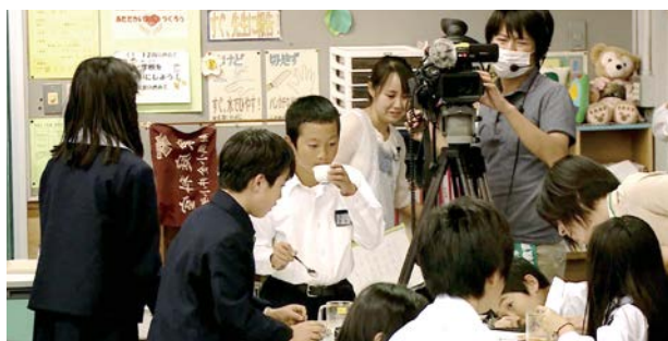
A scene of lesson video recording

This school year, a questionnaire will be added to help measure effectiveness on how the lessons have impacted students. The endeavors between subject-based education teachers of Tokyo Gakugei University and teachers of affiliated schools will be distributed all over the world by the OECD.