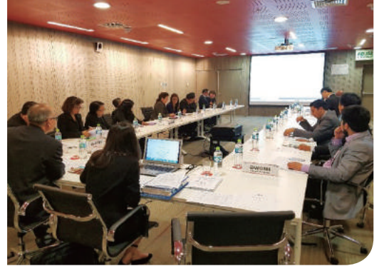
♠ Activities of APEC Future Education Consortium

ALCom (APEC Learning Community) is a global learning community seeking to fulfill the vision of shared prosperity in APEC through the catalyst of systematic educational innovation.