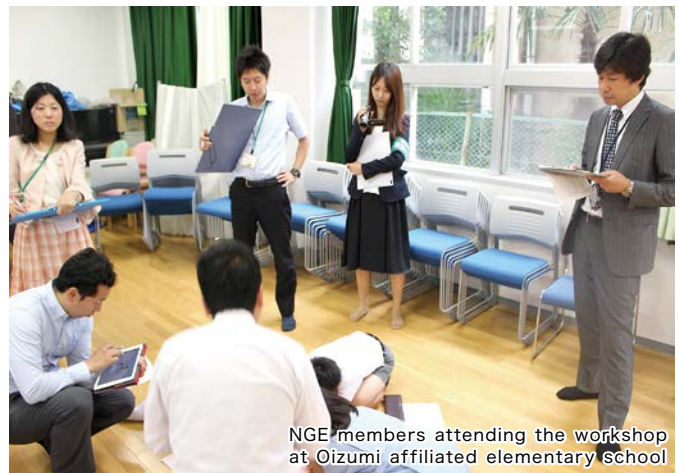
NGE members attending the workshop at Oizumi affiliated elementary school

These outcomes were relayed back at the workshop in Oizumi elementary school and reported at various academic conferences.